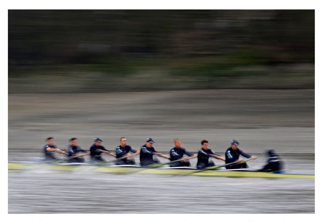
The Oxford University rowing crew practice on the River Thames.

Come with me on an Oxford rowing trip. Imagine for a moment that we are part of a team, rowing down the Thames past boathouses. The team is in great shape, and we are gliding at pace. Suddenly you notice we are on the wrong track: we must stop the boat and turn back as soon as possible. You try desperately to warn the crew, but no one is listening. The boat keeps going, and it is getting faster. Despite your warnings, we are heading straight for a catastrophe.<sup>1</sup>