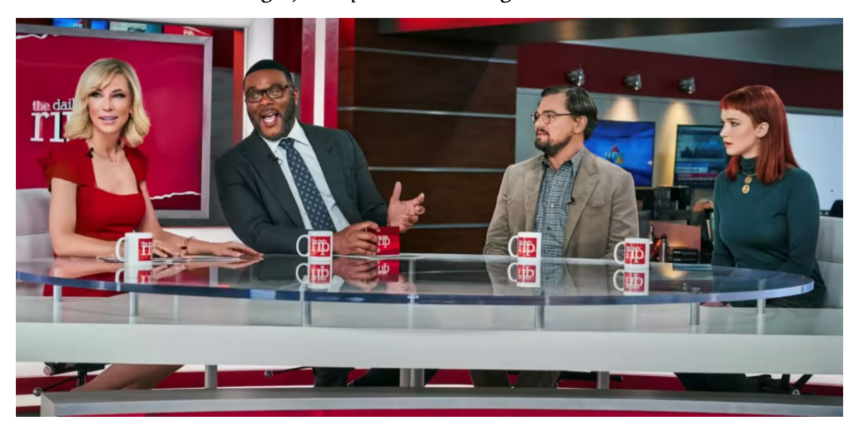
Publicity still from Don't Look Up movie.

News anchor 2: "Right, it helps the medicine go down."